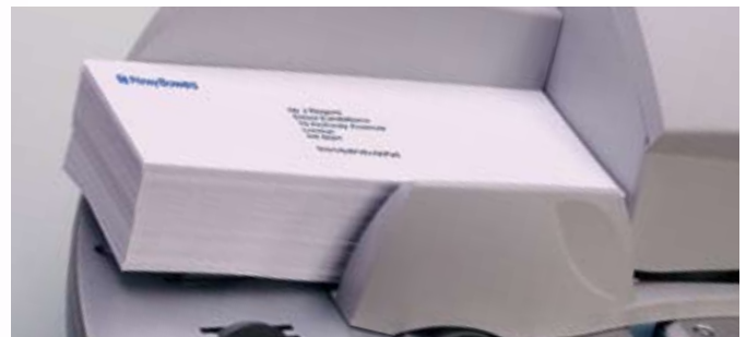
Automatic feeder quickly processes your mail