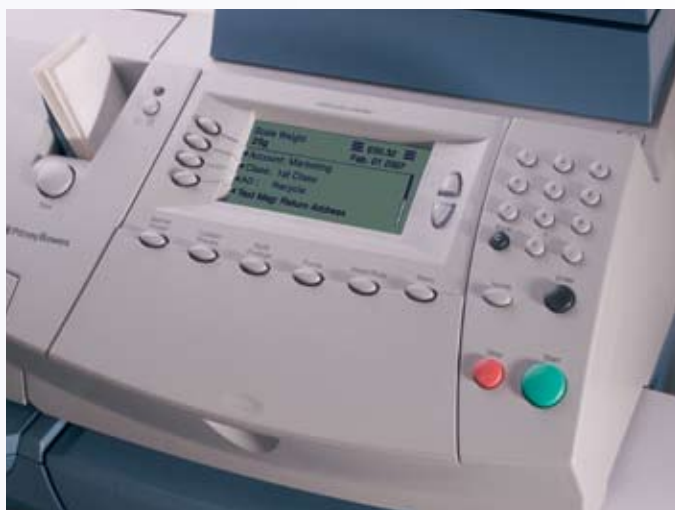
Easily add a custom text message with the qwerty keyboard

Energy Star qualified mailing machines automatically enter a low-power "sleep" mode after a period of inactivity. Spending a large portion of time in low-power mode not only saves energy but helps printing equipment run cooler and last longer.